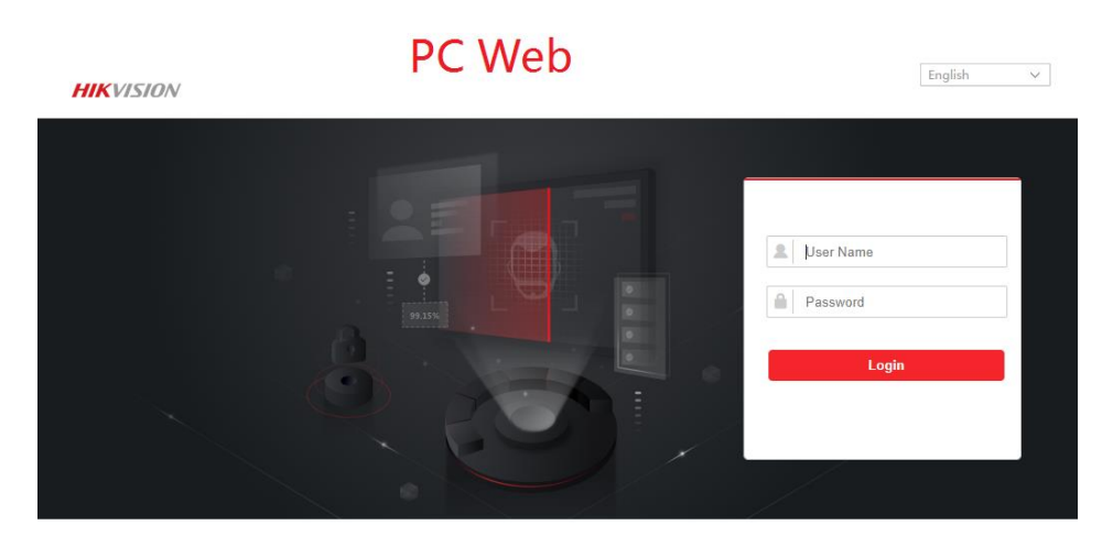
©2021 Hikvision Digital Technology Co., Ltd. All Rights Reserved.

16. Support multiple face authentication(maximum 5 person can be recognized at the same time) Note: after enable the function, card reader authentication mode, custom authentication and attendance status function cannot be used.